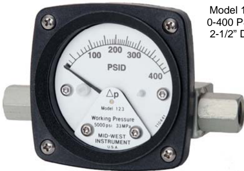
Model 123 0-400 PSID 2-1/2" Dial

A low cost differential pressure gauge for use in measuring the pressure drop across filters, strainers, separators, valves, pumps, chillers, etc., and for local flow indication and control.