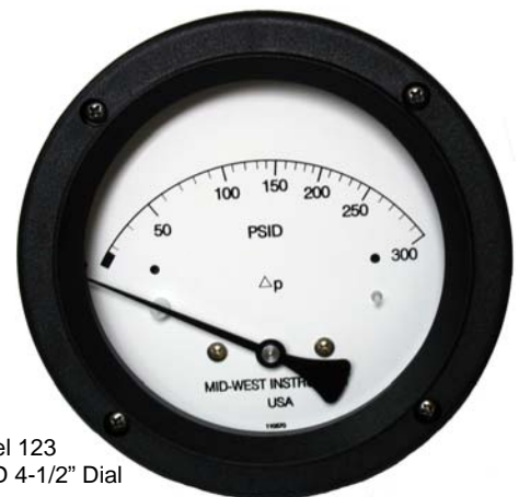
Model 123 0-300 PSID 4-1/2" Dial

An optional maximum indication follower pointer provides automatic indication of maximum differential occurring during a time period or system cycle. Reversed pressure ports are optionally available to facilitate installation and readability depending on which side of a filter, etc., the instrument must be installed.