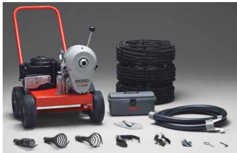
Model K-1500G with C-14 shown above.

Adjusts 7' to 12', supports cables, locks into place quickly.