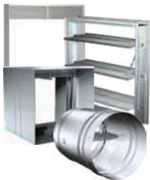
Model DFD-210, DFDAF-310, DFDAF-330 and SEDFD-210 are AMCA Licensed for Air Performance