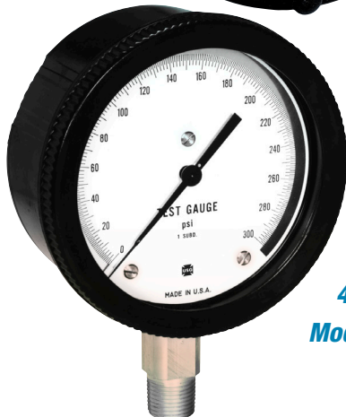
4-1/2" Model 1404