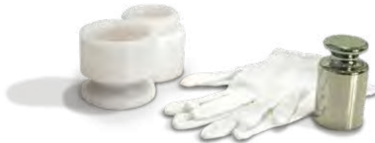
One Piece Kit