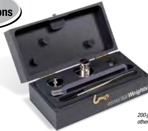
200 g PVC set shown, other sets will vary