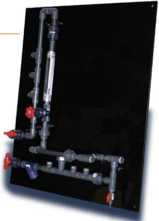
Single Tower Package (P/N: 7746461)