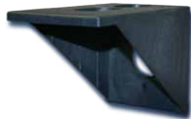
Wall-mounted Pump Shelf (optional)