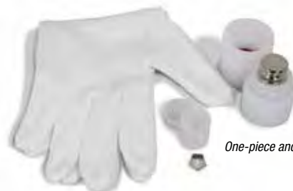
One-piece and Milligram Kits