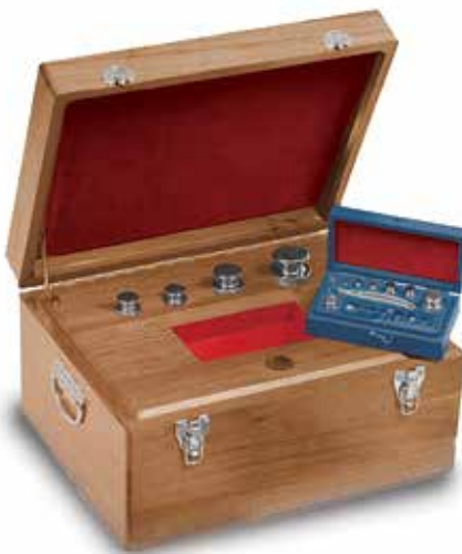
Set includes lifting device and gloves PN 30806 1 kg to 1 mg