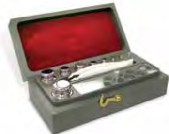
Set includes lifting device and gloves PN 30838 100g to 1mg