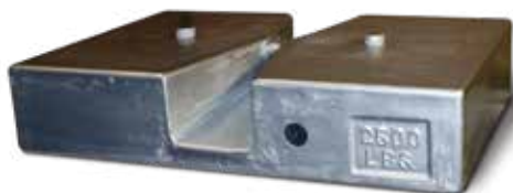
Nesting Slab PN 12860