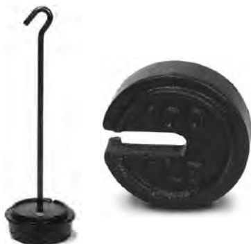
Howe Round Individual and Hangers