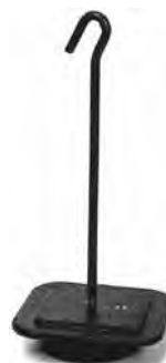
Fairbanks Square Individual and Hanger