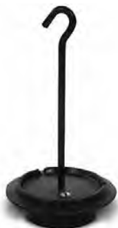
Fairbanks Round Individual and Hanger