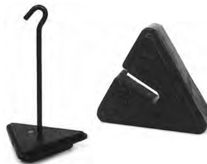
Toledo Triangle Individual and Hangers