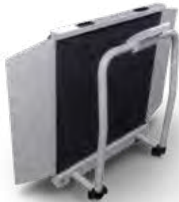
Wheelchair scale in folded position