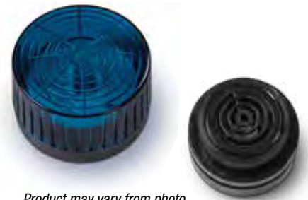
Product may vary from photo (reference photo only)