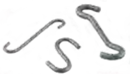
Hook (only) Weight (5 g - 1 g) and (1/4-1/32 oz)