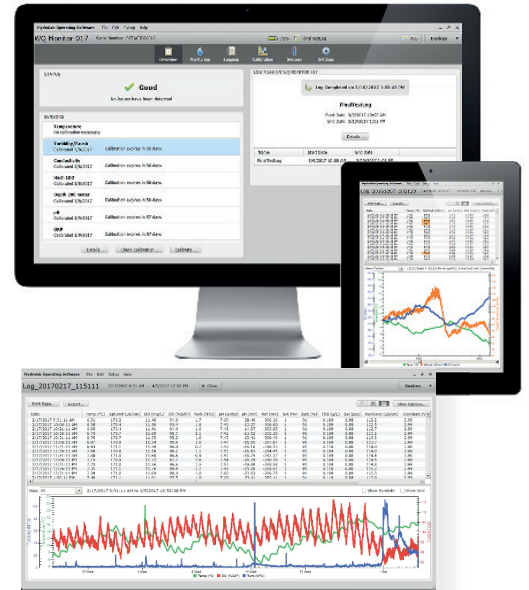
Quickly View Trends

Quickly view the current status of the instrument to ensure proper functionality