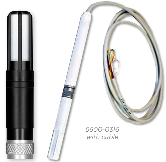
5600-0315 without cable