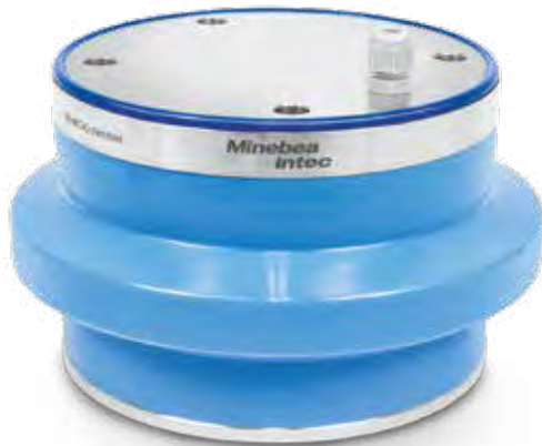
Junction Box not shown

The protective cover made of FDA-compliant silicone ensures a reliable encapsulation of the module and prevents the intrusion of dirt and microorganisms. The connecting geometry between protective cover and mounting plates guarantees a safe fitting and, together with the already excellent resistance to aging of the silicone, ensures reliable protection over years.