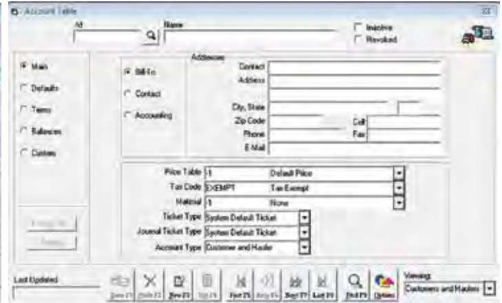
Customer Account Table