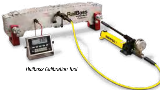
Railboss Calibration Tool