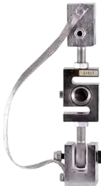
Module with RL20001 HE s-beam load cell.

The ITCM Series utilizes several Rice Lake Weighing Systems components to provide an unmatched level of performance in tank and hopper weighing applications and mechanical scale conversions. The ITCM HE incorporates clevis and unique rod-end ball joint assemblies to reduce the overall length to less than half of the traditional tension cell mounts, while providing correct load alignment. In addition, the load cell is completely electrically isolated from stray currents, which are a major cause of load cell failure. To complete the design, a grounding strap connects the two clevis assemblies to further provide safety to your load cells.