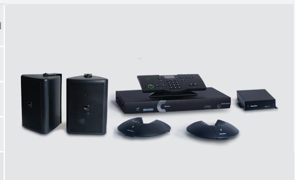
*Formerly known as INTERACT COM