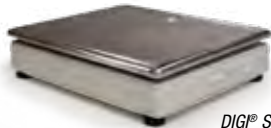
DIGI® Scale Base