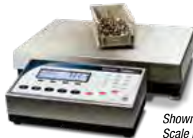
Shown with BenchMark® Scale Base and Bracket