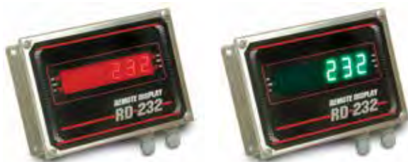
RD-232 Compact Stainless Steel Wall Mount Enclosure