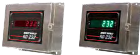
RD-232 NEMA Type 4X Stainless Steel Wall Mount Enclosure