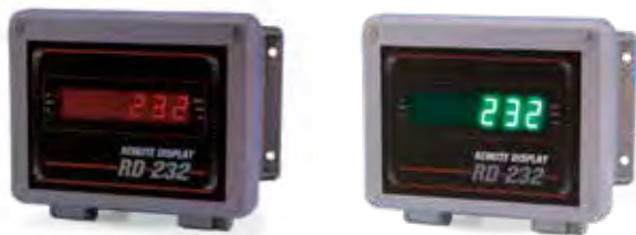
RD-232 NEMA Type 4X FRP Enclosure