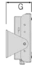
LaserLT-100 Optional Side Bracket