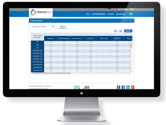
Hydromet Cloud can help you assess when a site visit is required and retrieve data as needed to create data product, e.g., reports