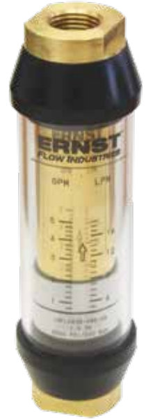
Basic (Brass Construction Shown)