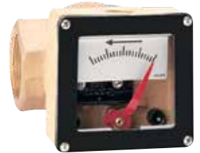
MODEL EFI 816BC WITH MICROSWITCH (shown with faceplate removed)

When the Teleflo is equipped with a microswitch and conduit connection, it can operate a bell, whistle or similar alarm. When used in relay, it can be used to shut off a pump motor should the liquid flow stop.