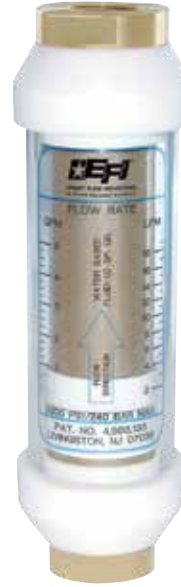
High Temperature (Brass Construction Shown)