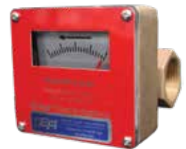
MODEL EFI 815BC (Without Microswitch)