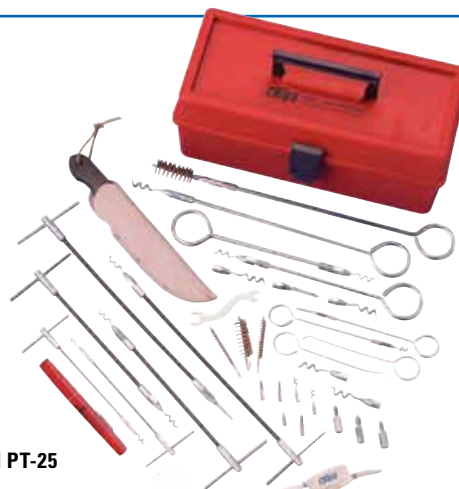
MODEL EFI PT-25

A complete line of tools designed to handle your packing maintenance with ease. The unique interchangeability of tips with flex or rigid holders allows a versatility not available elsewhere. Worn or damaged tips may be replaced at minimum cost rather than sacrificing the entire tool.