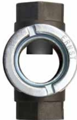
MODEL EFI E-57-2 (Drip Tube)