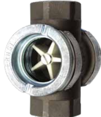
MODEL EFI E-57-3 (Rynite® Rotating Wheel)