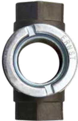
MODEL EFI E-57-0 (Plain)