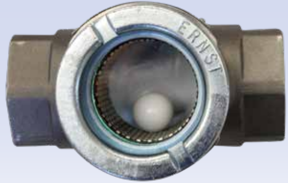
MODEL EFI E-57-4 (Ball Action - Specify Ball Material)