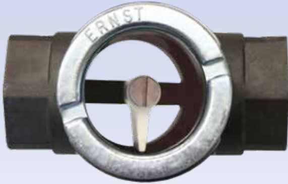
MODEL EFI E-57-1 (Rynite® Flapper) Not recommended for downward flow