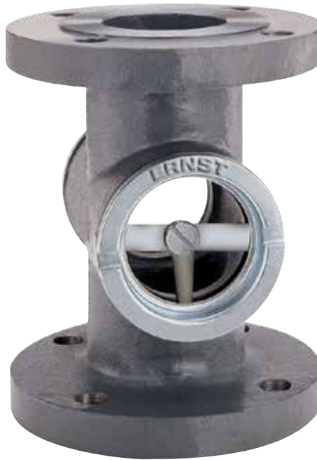
MODEL EFI 215-F (Rynite® Flapper)