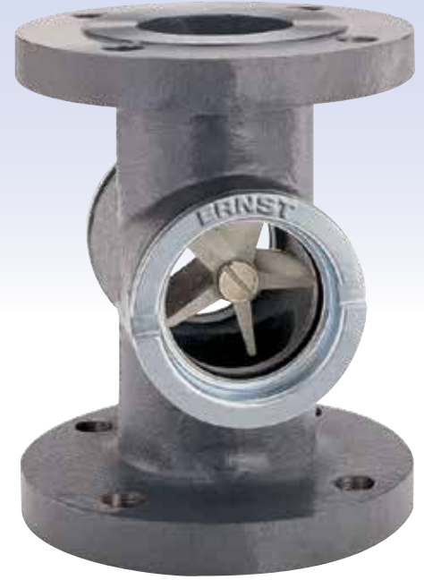
MODEL EFI 215-R (Rynite® Rotating Wheel)