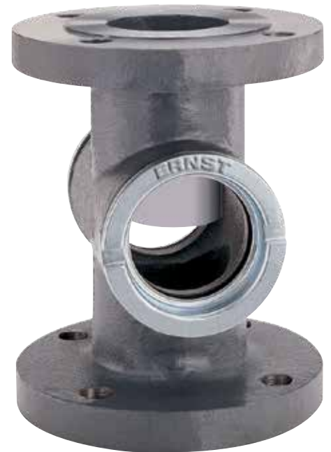
MODEL EFI 215-D (Drip Tube)