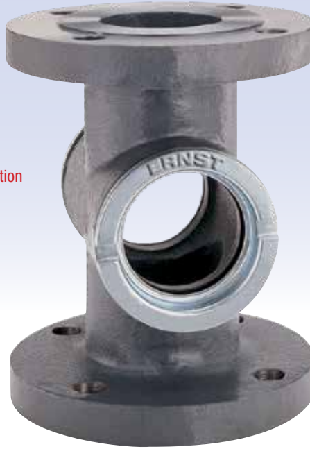
MODEL EFI 215-P (Plain)

Consult Ernst Flow Industries for PVC dimensions and weights.