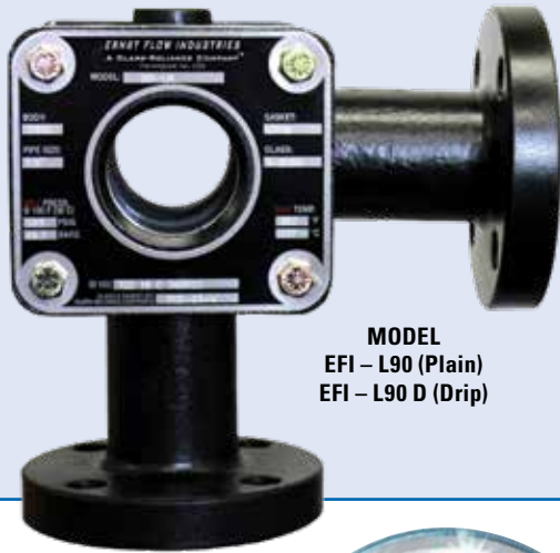
MODEL EFI - L90 (Plain) EFI - L90 D (Drip)

BLACK TYPE: NEOPRENE SEAL GASKETS AS STANDARD