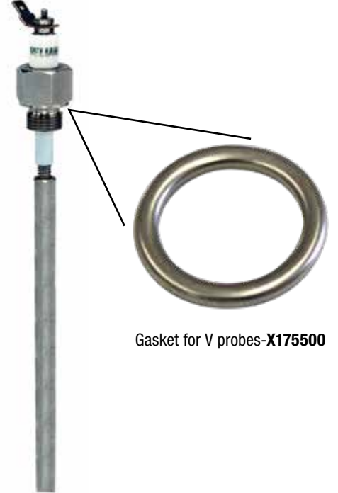
Gasket for V probes- X175500

with 2 Gaskets For Steel Water Columns (up to 1000 PSI)- RV360RK