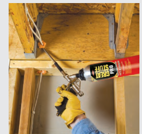
Electrical wire penetrations

§ When used outdoors, cured foam will discolor when exposed to natural light. Paint or coat foam for best results.