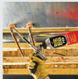
Gas line penetrations

Use GREAT STUFF PRO™ Gaps & Cracks Insulating Foam Sealant to seal and insulate around common areas of energy loss such as foundation/sill plate, outdoor fixtures, pipe penetrations, attic and more. §