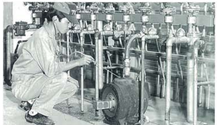
● Steam Equipment

Specifications are subject to change without notice.