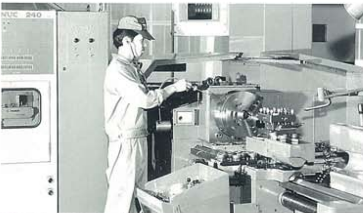
● Machine Tool Bearing