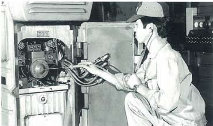
● Electric Motor