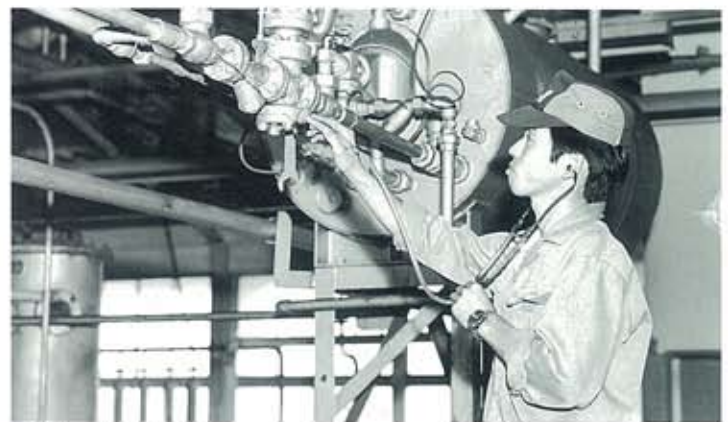
● Valve Leakage