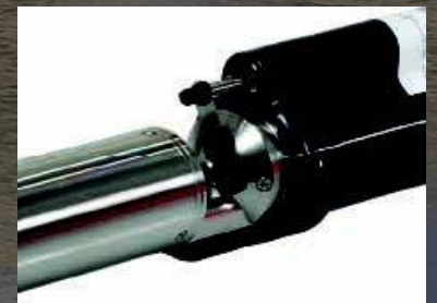
Wiper reduces bio-fouling