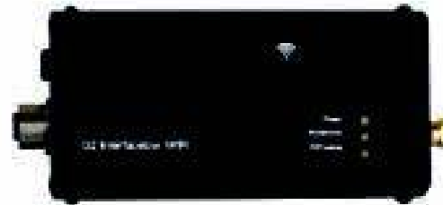
Local access to settings with the G2 interface

The internal data files can be exported to CSV formats for further analysis.