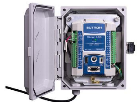
Integrate into a remote data acquisition system

Online nitrate monitoring systems consist mainly of three components which are the nitrate sensor, a multi-parameter sonde and a data logger as the centerpiece of the system. The OTT ecoN is designed to interact with a variety of data loggers such as OTT netDL, Sutron SatLink3 and XLink. A system approach provides a multitude of advantages including wiper control, access to the quality control data, USB interface for local communication, Wi-Fi operation with wireless devices, full IP compatibility, data transmission via satellite and remote maintenance opportunities.