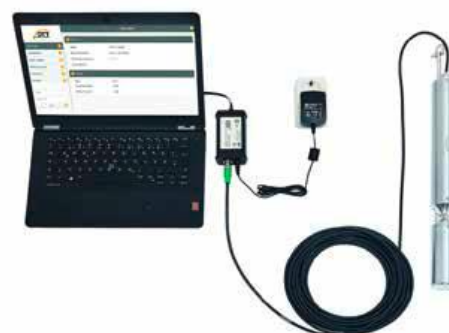
Web browser software