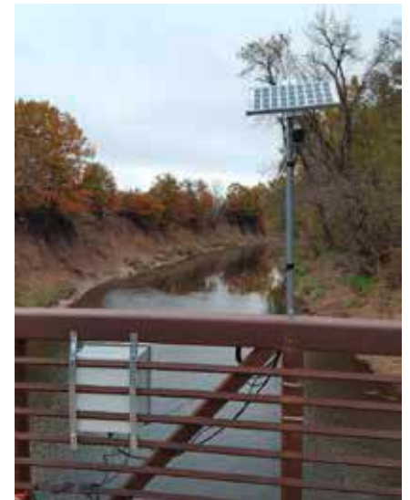
Solar power surface water monitoring station