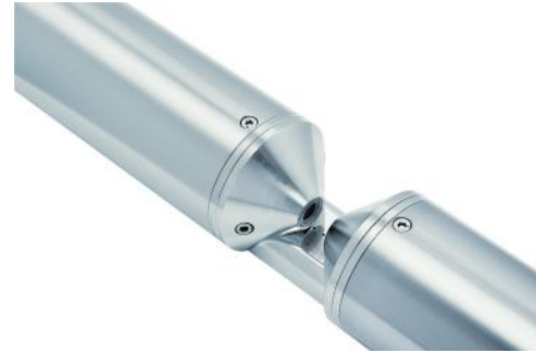
Path length between lens system

A key part of the measurement system is the path length between the lens system, as the range of detectable nitrate concentrations is influenced by this distance. Choosing the correct path length based on the expected concentrations is important and additional influences such as turbidity ranges should also be considered. An advantage of the modular approach of the OTT ecoN lies in the ability to have the lens system and calibration adapted by factory trained personnel. IP compatibility, data transmission via satellite and remote maintenance opportunities.