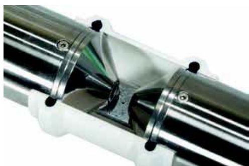
Standard calibration solution verification with VALtub half-cup