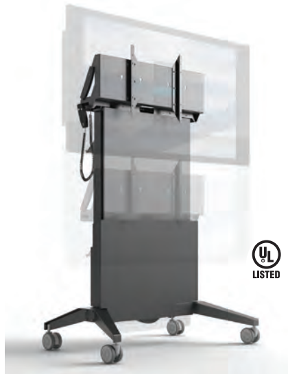
FPS1/EL/GG Electric Lift Mobile Stand

CA/MAC1: Cisco Sparkboard 55" adapter CA/MAC2: Cisco Sparkboard 70" adapter