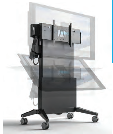
FPS1/ELT/GG Electric Lift & Tilt Mobile Stand

Holds displays 42-65", up to 175 lbs (79 kg) †