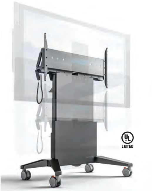
FPS1XL/EL/GG XL Electric Lift Mobile Stand

Fully adjustable, electric lift, mobile stands that offer convenience, flexibility, and designer style. The sleek, compact design moves easily between spaces and is designed for touchscreen in working, drafting, collaboration, and presentation positions.