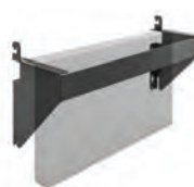
Vertical Rack Mount FPSA/VR/3U FPSA/UR/5U