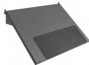
Keyboard Storage Shelf FPSA/KS/GT