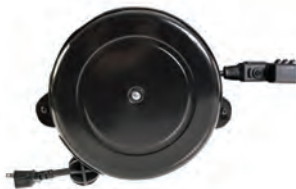
Retractable Power Cable Reel FPSA/CR