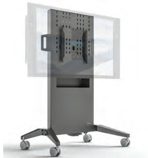
FPS1/FH/GG Fixed Height Mobile Stand

CA/MAC1: Cisco Sparkboard 55" adapter CA/MAC2: Cisco Sparkboard 70" adapter