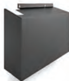
Equipment Storage Cover FPSA/SC/GT