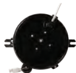
Retractable CAT6 Cable Reel FPSA/CR/CAT6