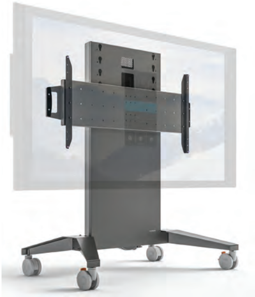
FPS1XL/FH/GG XL Fixed Height Mobile Stand

Fixed height, mobile stands were designed to meet your needs, these stands deliver sleek design, functionality and mobility.