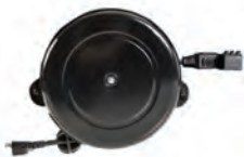
Retractable Power Cable Reel FPSA/CR