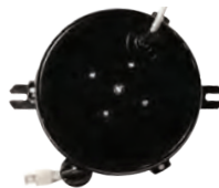
Retractable CAT6 Cable Reel FPSA/CR/CAT6