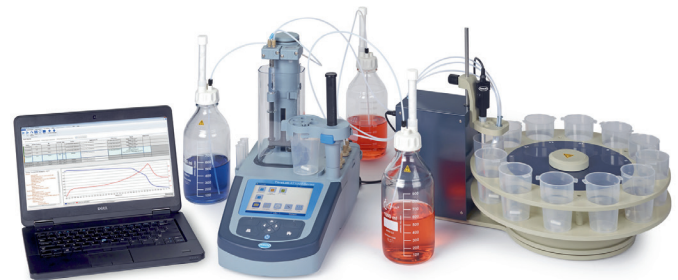
System setup illustration with AT1000 Series Titrator and AS1000 Sample Changer

AS1000 Sample Changer multi-parameter automation solutions release operators' time from cumbersome repetitive analyses for more valuable tasks that cannot be automated.