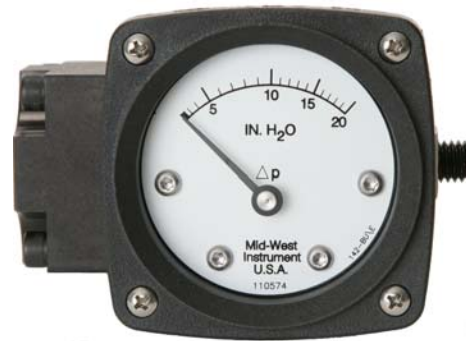
Model 142 0-20" H 2 O with 2-1/2" Dial

Ideally suited for use on dissimilar fluids and wet gas or fluids with a high concentration of solids, etc.