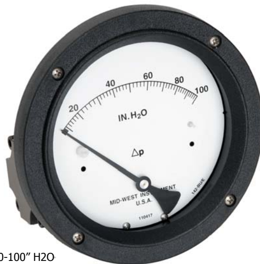
Model 142 0-100" H 2 O with 4-1/2" Dial