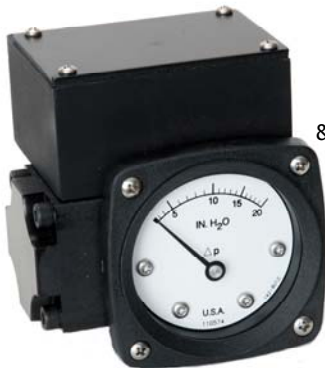
Model 142 with 2-1/2" Dial & 4-20mA Transmitter

“A World Leader in Differential Pressure Gauges, Switches & Transmitters