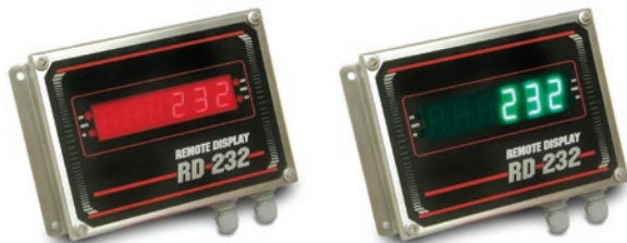
RD-232 Compact Stainless Steel Wall Mount Enclosure