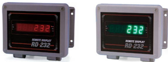
RD-232 NEMA Type 4X FRP Enclosure