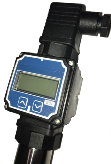
LCD or LED 3-1/2 Digit Display