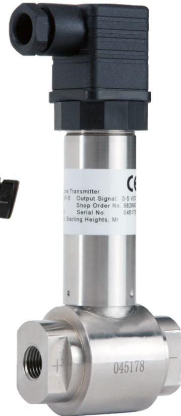
¼" BSPP x ¼" FNPT ¼" BSPP x ½" FNPT S.S. Adapters Available