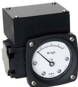
Model 142 with 2-1/2" Dial & 4-20mA Transmitter

“A World Leader in Differential Pressure Gauges, Switches & Transmitters