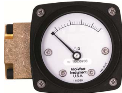
Model 142 with 2-1/2" Dial

Pictures do not represent actual body material