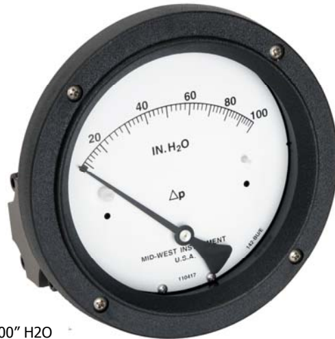
Model 142 0-100" H 2 O with 4-1/2" Dial