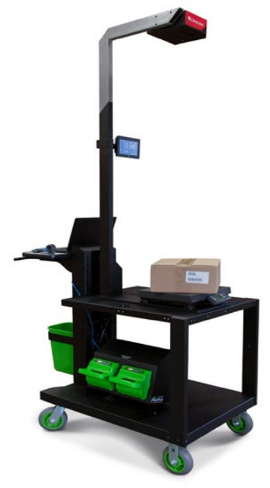
30" with Power Swap Nucleus® Lithium Power System