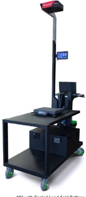
48" with Sealed Lead Acid Battery

The iDimension Plus Mobile carts were designed to enable quick and accurate dimensioning directly at your product location. The cart series consists of 30" and 48" long workstations that hold and power the iDimension Plus and other accessories including scales, laptops, integration solutions and bar code scanners up to 12 + hours ar a time or 24/7 operation.