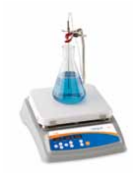
Professional Hotplates, Stirrers & Hotplate-Stirrers