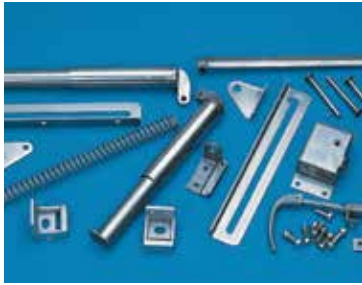
Stainless Steel Hardware