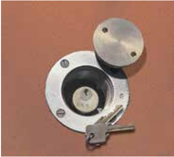
Keyed Cylinder Locks