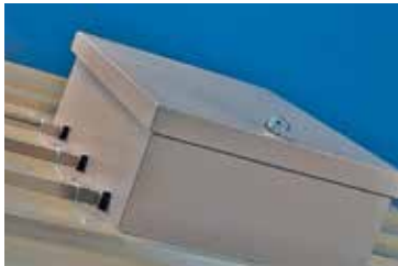
Curb Modification for Metal Buildings