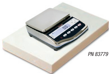
Reduces vibration and shock, ideal where tables will not fit