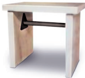
Provides the most stable surface possible for precision instruments. Legs are reinforced with support pipe.