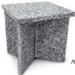
Mass, density and vibration damping properties for most applications (four damping pads included).