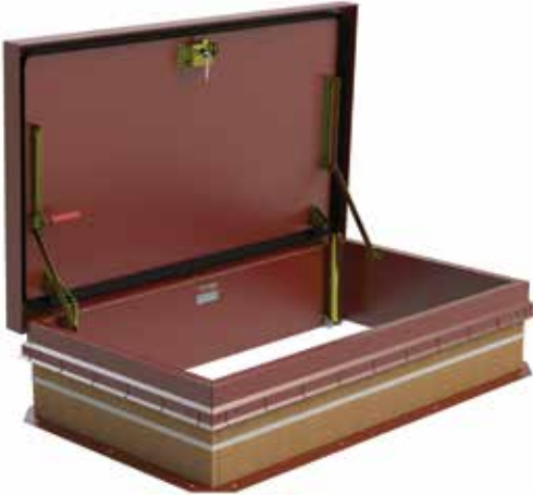
Type NB Type NB-HZ

Log on to www.BILCO.com to find a sales representative near you.