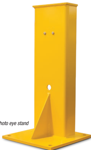
Photo eye stand