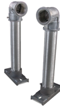
Side Mount Brackets