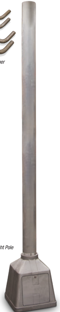
Traffic Light Pole