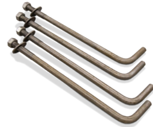
Anchor bolt with nut and washer