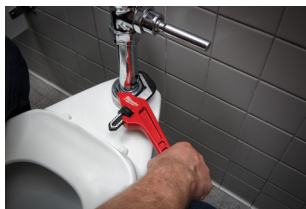
Protects Chrome Surfaces