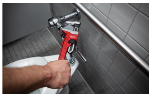
Protects Chrome Surfaces