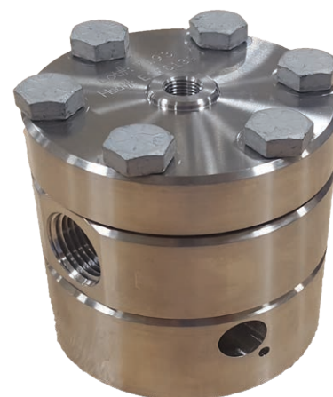
Custom model Equilibar® B6R with added feature for heating cartridge. Contact us for more details.

These regulators are subject to one or more of these patents: US6,886,591, US7,080,660, US7,673,650, US8,215,336, DE60322443D1, GB1639282, FR1639282