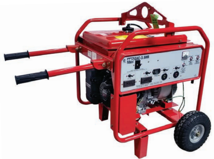
GAC36HR 3600 watts max. Honda engine, recoil start