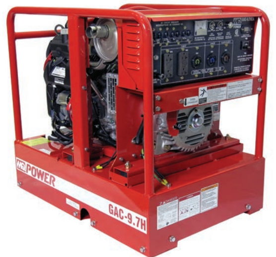
GA97HEA 9700 watts max. Honda engine, electric start Battery Specifications: 38B19R / MQ # Y0165103819