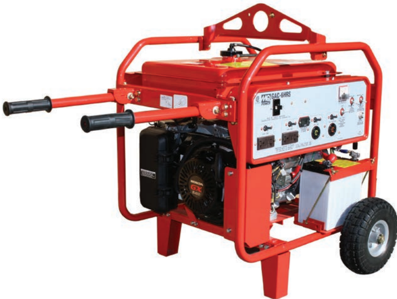
GAC6HRS 6000 watts max. Honda engine, recoil/electric start Battery sold separately Battery specifications: 12N243A / MQ # 0162212024