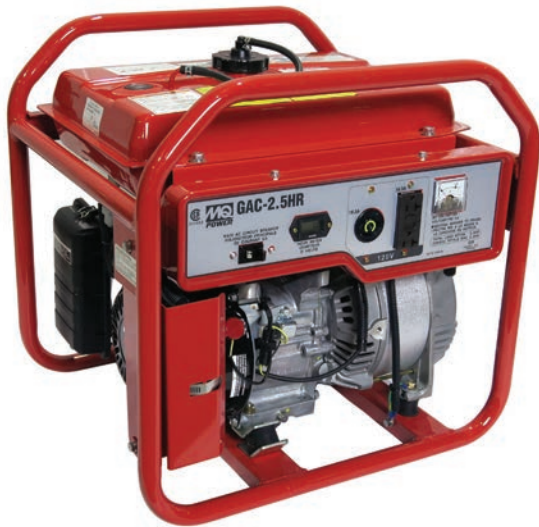
GAC25HR 2500 watts max. Honda engine, recoil start

There's a size and model for every application.