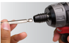
Power Tool Compatibility