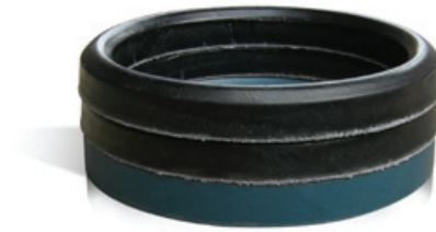
Garlock Blue DURATUFF® Header Ring