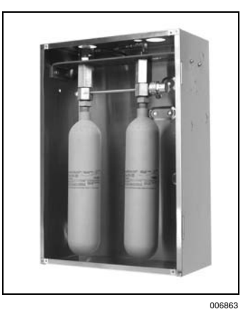
Water Tank Expellant Gas Assembly

Weight: Approx. 65 lb. (30 kg) including charged tank