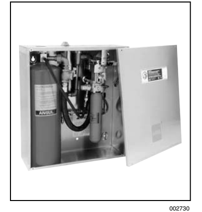
Standard PIRANHA AUTOMAN Release

3.2.1 Employees shall be instructed in personal safety and the operation of the system by authorized distributors who are trained by the manufacturer.