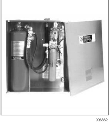
Self-Contained PIRANHA AUTOMAN Release

Weight: Approx. 70 lb. (32 kg) including charged tank