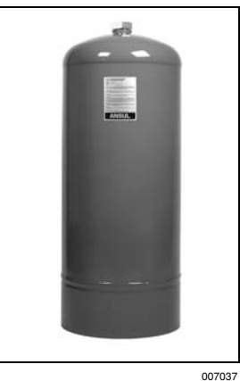
Self-Contained Water Tank

Weight: Approx. 31 lb. (14 kg) including cartridges